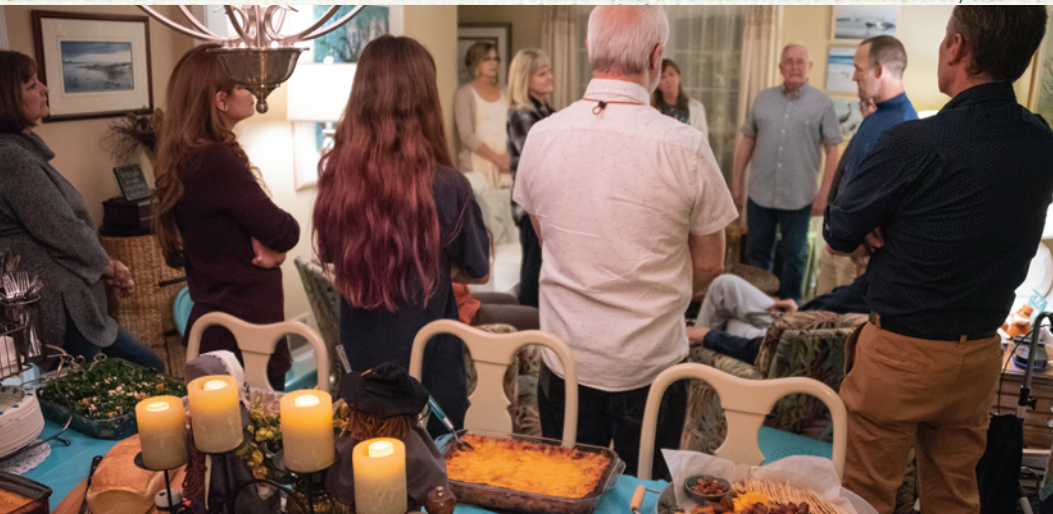
NEIGHBORHOODS AND NEXT GENERATION